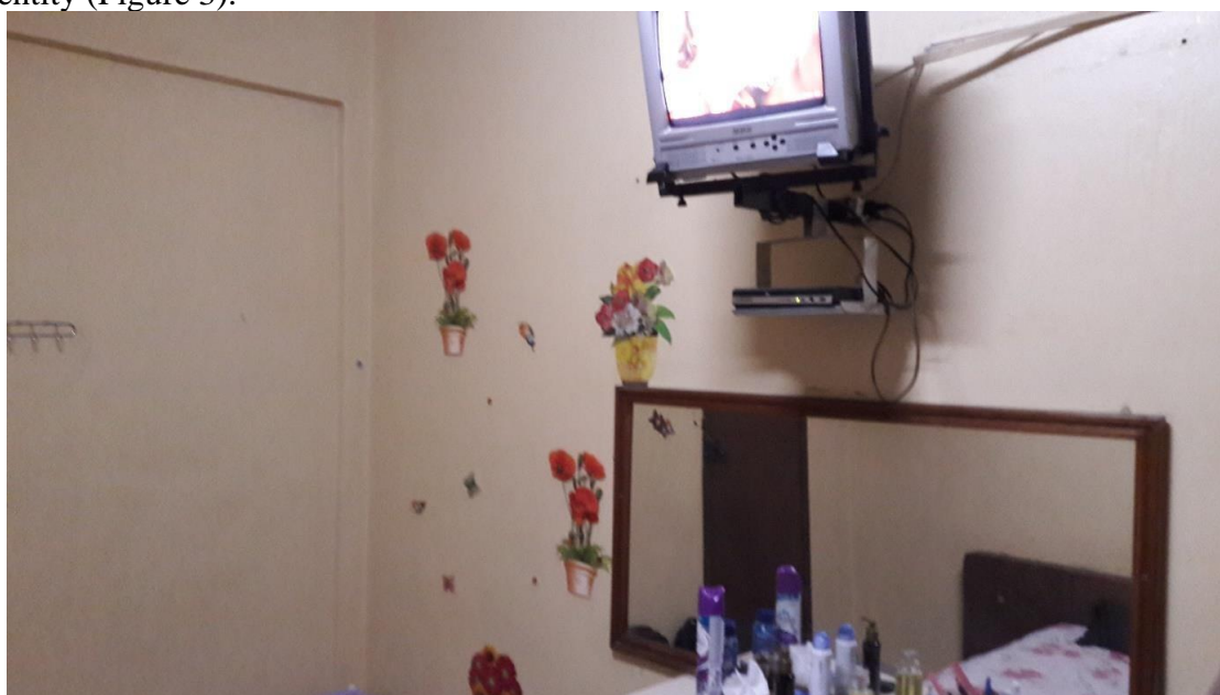
Figura 3. Mitigating the pains of a loathsome place

Inside the rooms, the power relationship seems to be reversed and the women become the dominant figure. Upon entering there, we identify a process of spatial-temporal reterritorialization, for the dominated temporarily assume the role of dominant, even if in a contradictory way, as they must serve their female bodies to male pleasure. Therein, the place can be fragmented so that each part is redefined and assumes a new identity (Figure 3).